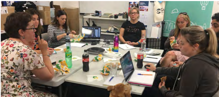
11:30am, Friday 13 March